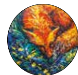
Bedroom artwork Painting