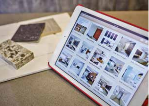
PORTFOLIO Rhiss Interior has a varied portfolio of designs, with each project showcasing a unique personality and bespoke identity.