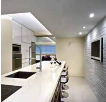
NATURAL BEAUTY An on-going theme in Rhiss Interior's design direction is natural beauty, where an organic material palette and an openness to natural sunlight takes centrestage.