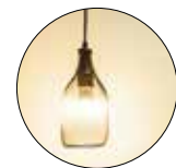
Bedroom light Industrial pendant lamp