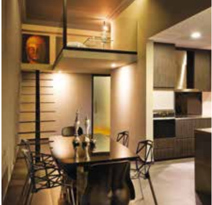
EARLIER WORKS Before the industrial style fully caught on, Rhiss Interior was already experimenting with elements of it, as can be seen in this private apartment.